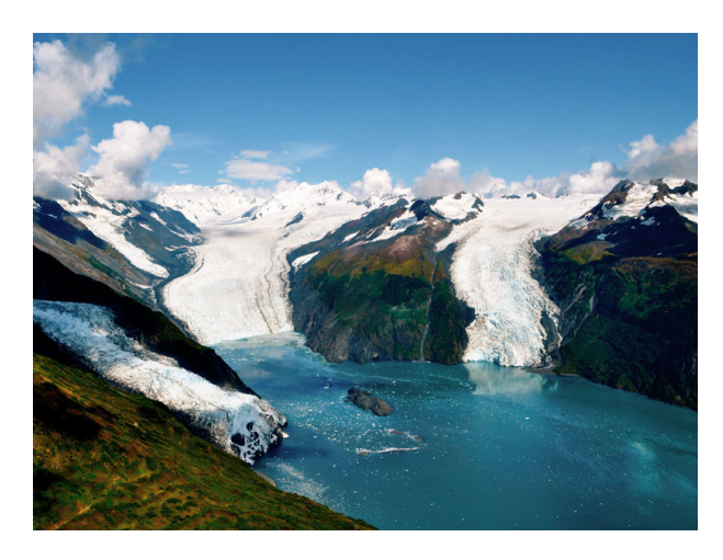
Alaska Stillpoint Lodge with Denali by Train