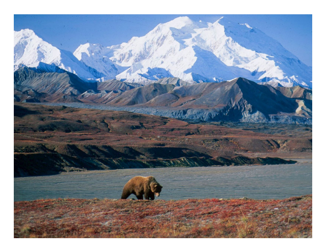
Denali Alaska Railroad Highlights