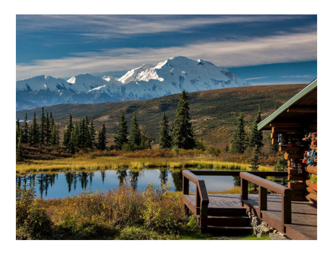
Denali Backcountry Lodge Explorer