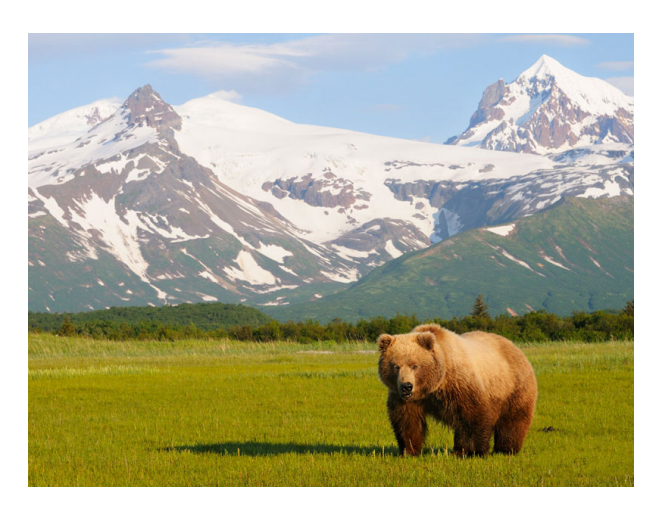
Grand Alaska Rail Tour Cruise Connector